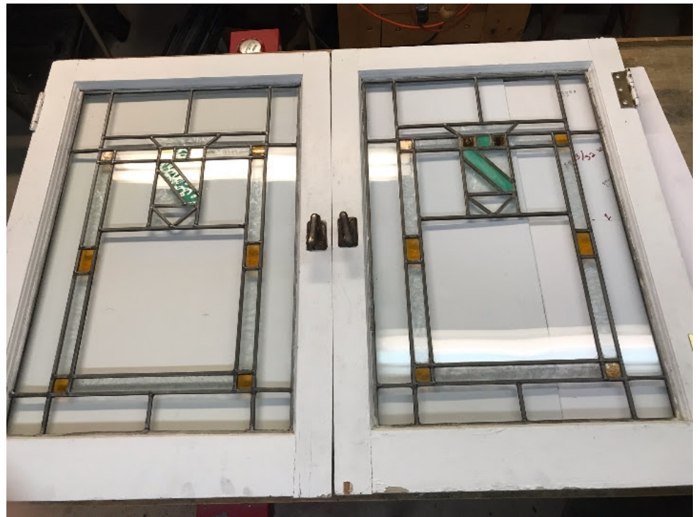
Fully Restored Porch Casement Windows - 314 19 th Street S.