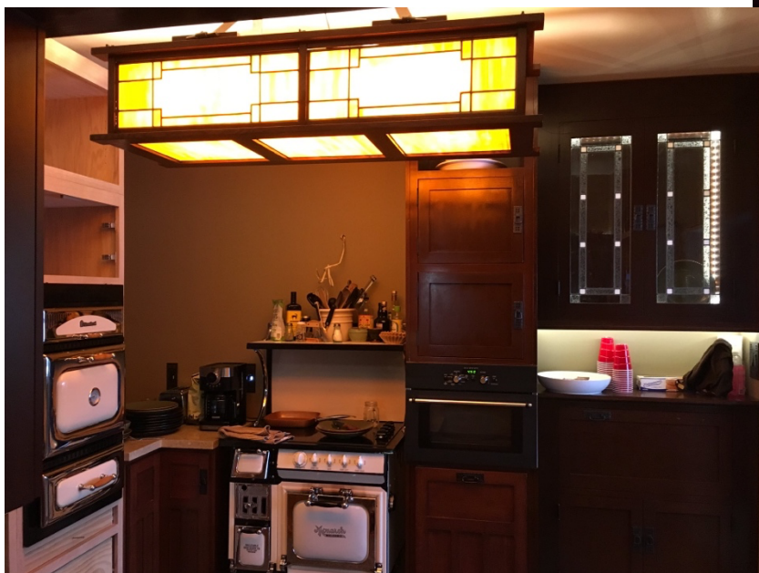
Custom Art Glass Ceiling Light and Cabinet Panels - Ranum-Nelson House.